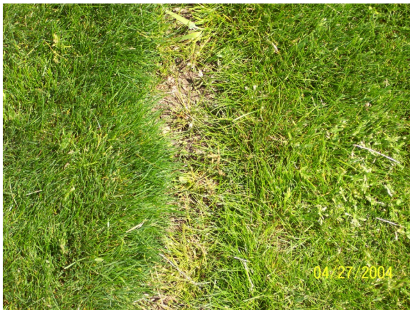
Rhino Hard Fescue Commercial Variety

Rhino has exhibited improved resistance to Red Thread, Summer Patch and Dollar Spot.